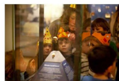
Volunteering with Visitors

Please note: the Volunteer Service does not organise work experience, work placements, or internships.