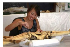
Volunteering Behind the Scenes