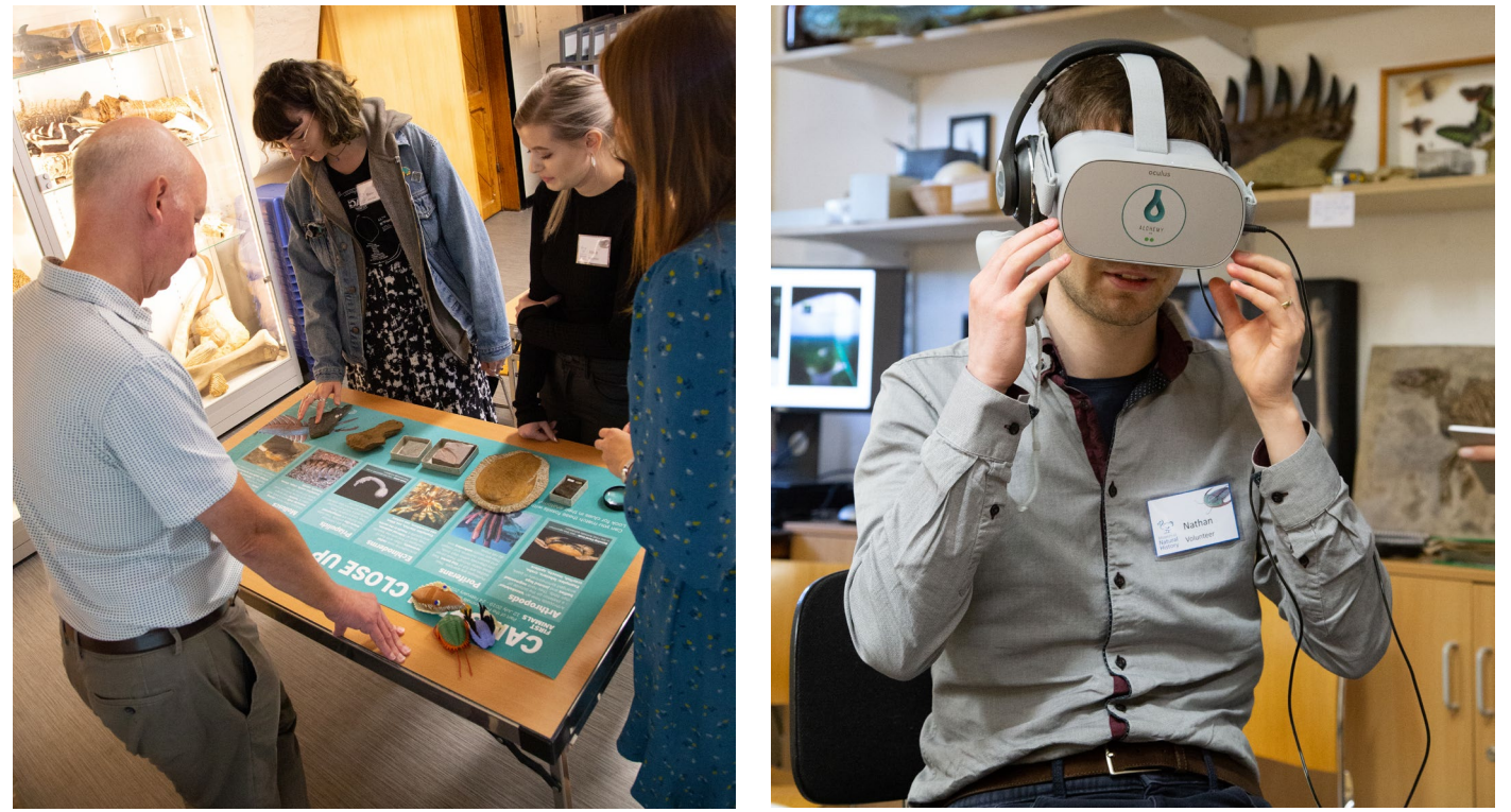
Cambrian Close Up volunteers having a go at matching ancient and modern animals and using the virtual reality headset as part of their training

What difference does 500 million years of evolutionary history make?! That is one question being posed to visitors as part of the Museum of Natural History's new volunteer-led 'Cambrian Close Up' activity. Volunteers help visitors to find out by making connections between animals alive in the Cambrian period (over 500 million years ago) and animals alive today. The activity, which was inspired by the current 'First Animals' exhibition, includes the chance for visitors to handle real fossils and - a first for the museum - to immerse themselves in ancient oceans through a virtual reality experience! The activity, which happens every other Saturday (alternating with 'Out of the Deep' object handling), began in September 2019 and is set to continue until September 2020.